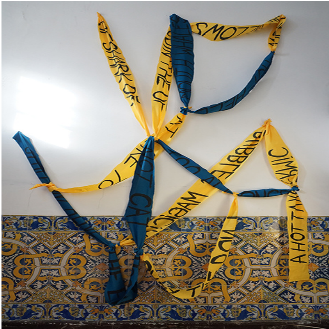
The Enough (Lisboa dia/noite) Figura Avulsa, Lisbon, PT black lava emulsion on fabric, needles 122 x 62 3 / 4 x 4 inch / 310 x 160 x 12 cm 2021