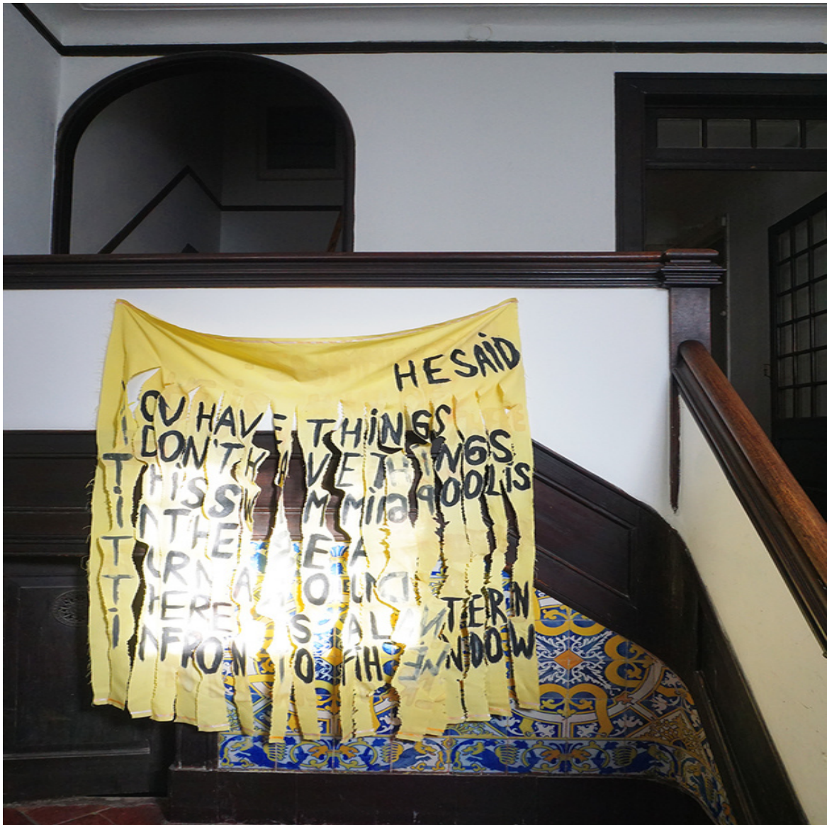
He Said Figura Avulsa, Lisbon, PT black lava emulsion, wax and fabric dye on fabric 59 x 44 inch / 150 x 112 cm 2021