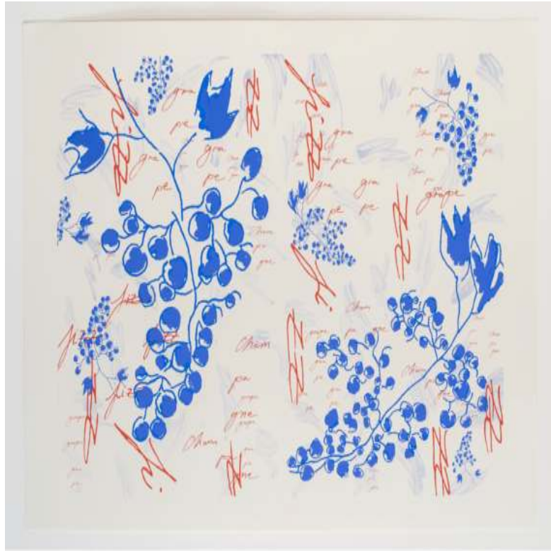
Blue Champagne silkscreen gouache on paper 28¼ × 40 inch / 72 × 102 cm 2021