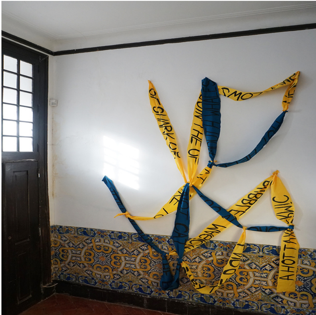
The Enough (Lisboa dia/noite) Figura Avulsa, Lisbon, PT black lava emulsion on fabric, needles 122 x 62 3 / 4 x 4 inch / 310 x 160 x 12 cm 2021