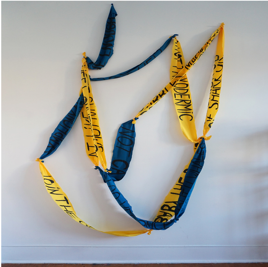
The Enough (Lisboa dia/noite) AIR 351, Cascais, PT black lava emulsion on fabric, needles 122 x 62 3 / 4 x 4 inch / 310 x 160 x 12 cm 2021