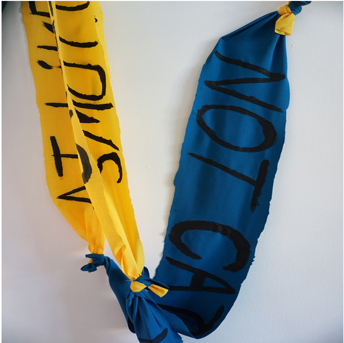
The Enough (Lisboa dia/noite) Figura Avulsa, Lisbon, PT black lava emulsion on fabric, needles 2021