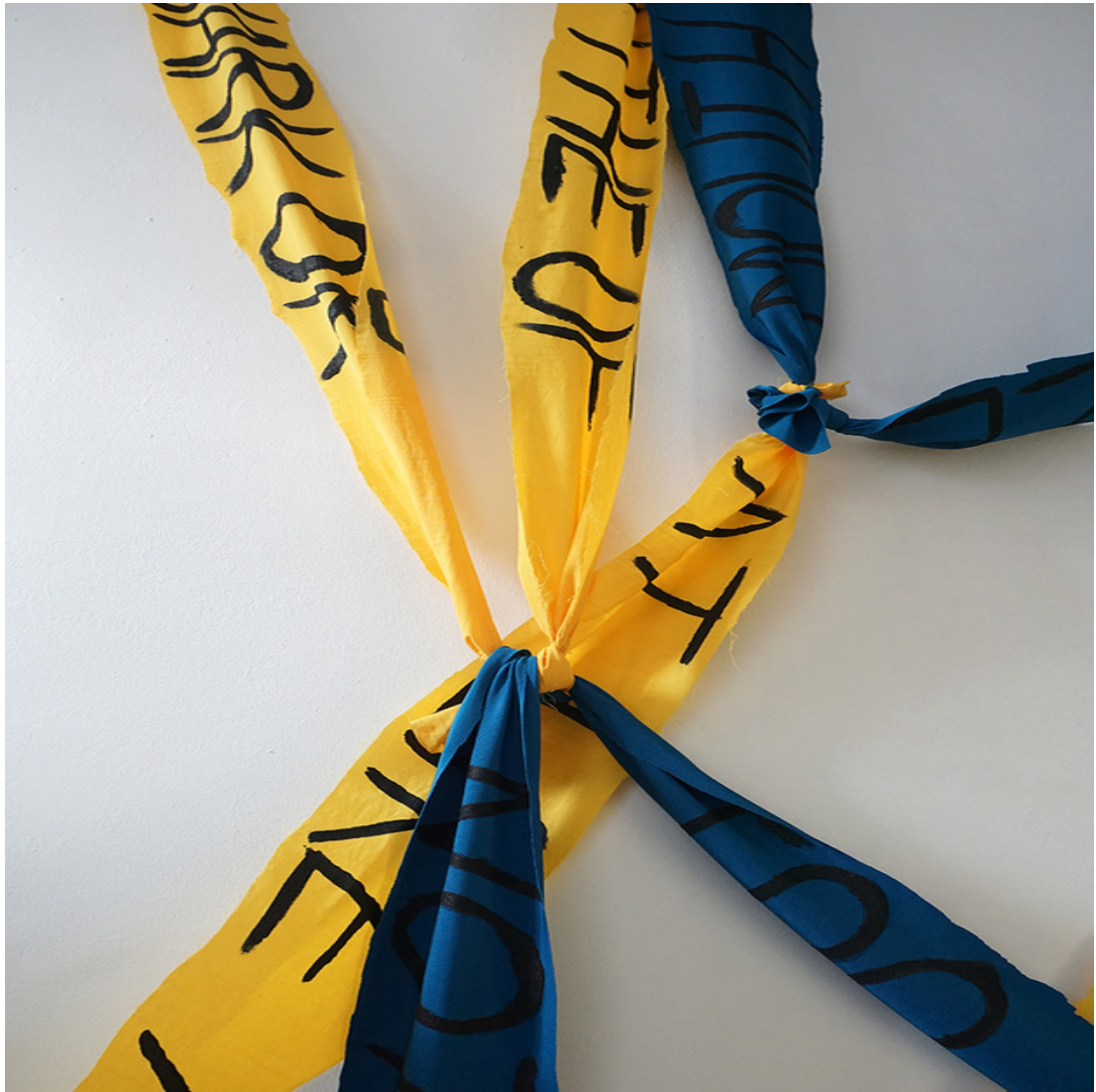
The Enough (Lisboa dia/noite) Figura Avulsa, Lisbon, PT black lava emulsion on fabric, needles 122 x 62 3 / 4 x 4 inch / 310 x 160 x 12 cm 2021