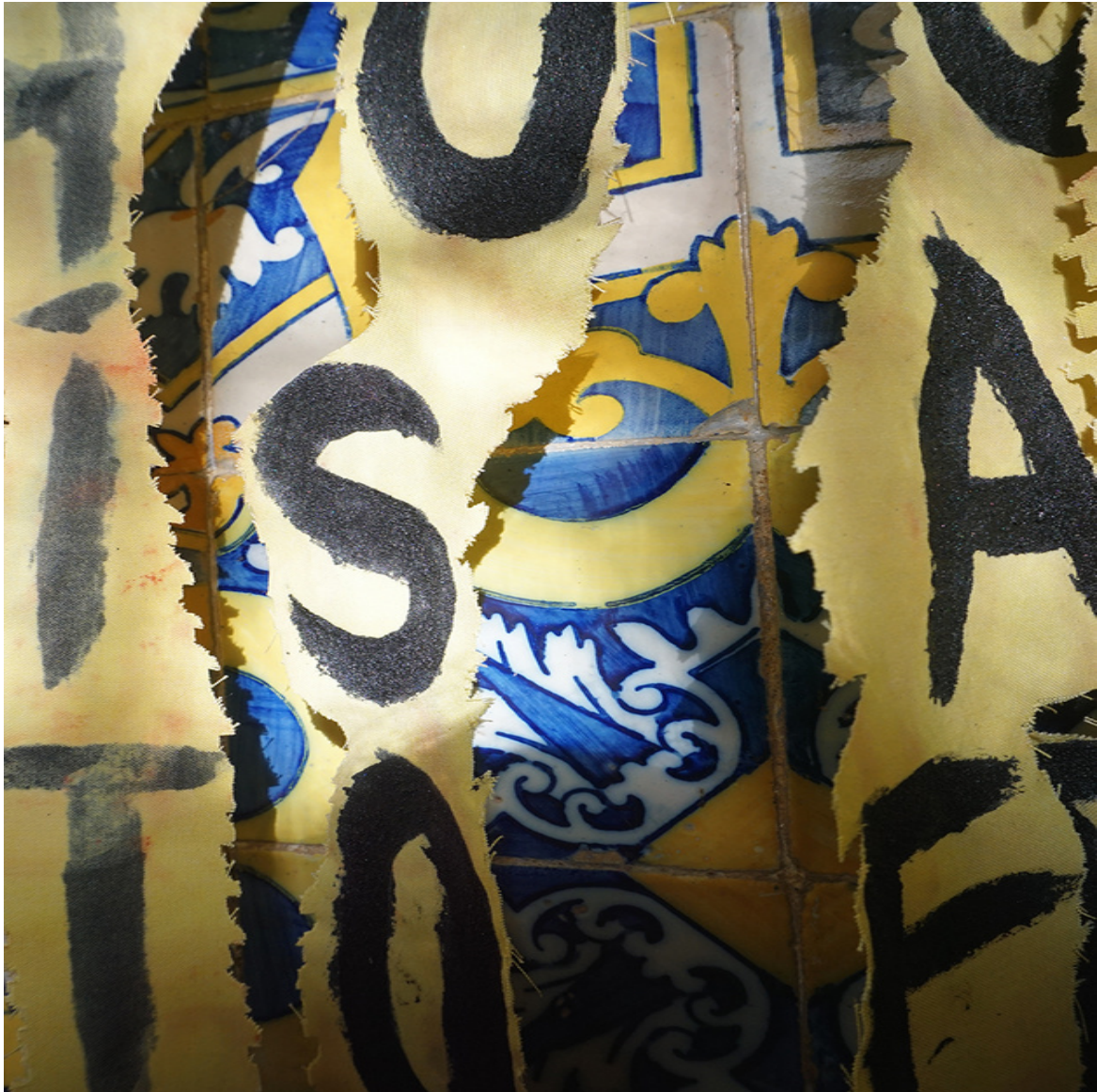
He Said Figura Avulsa, Lisbon, PT (detail) black lava emulsion, wax and fabric dye on fabric 59 x 44 inch / 150 x 112 cm 2021